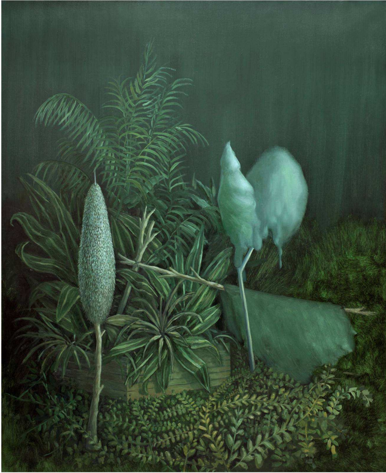
Not landscape nor still life (2010)

Perhaps what is most striking is the extremely naturalist way of depicting the plants, similar to a botanical study, as well as the use of neutral, distant backgrounds.